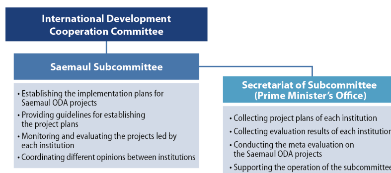
Figure 2. Status and Functions of Saemaul Subcommittee

international organizations. Cooperation projects with multilateral development banks are managed by the Ministry of Strategy and Finance (MOSF).